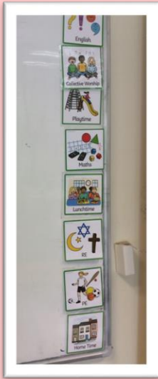
a visual timetable used in all classrooms

All teachers work using a 'Quality First Teaching' principle, which means that many pupils with special needs can participate in class without specialist help. For example, the teacher breaks down tasks into small 'bite-size' chunks, presents ideas using visual, audio and practical resources, allows thinking time before expecting answers and provides a variety of tabletop resources to help pupils with their tasks.